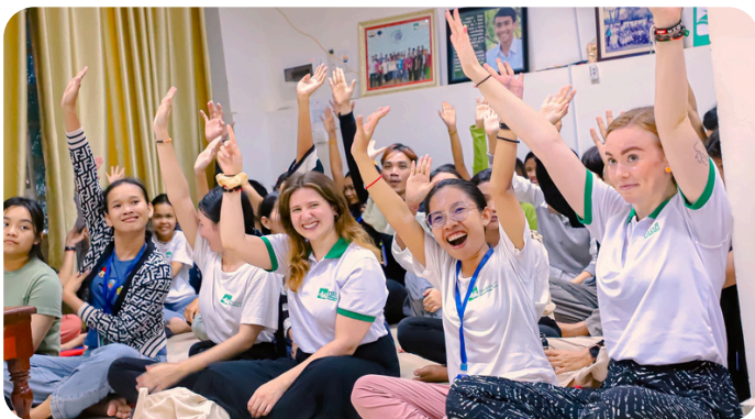
Below: Students joining our visiting educators during the 3-week long Cambodia-Ireland Exchange program.