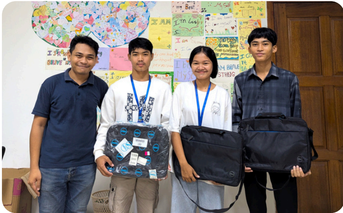
The winners of the Capcut Video editing competition receiving a laptop case as a reward for their hard work.

In the latest quarter, PEPY's ICT Project engaged students in 72 lessons focused on Canva and Capcut to enhance their creative skills through practical applications. The program included 11 lessons on Canva, where students learned to design posters, CVs, and presentations, and 56 lessons on Capcut, which covered video editing techniques. Students collaborated in class, allowing them to inspire one another while building essential skills for future education and career opportunities.