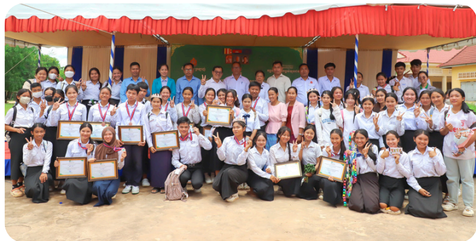
Kralanh school teachers, principal, and PEPY staff with contestants holding certificates of appreciation and medals.

Dream Managers conducted the Quarter 4 Meeting & Reflection with 19 teachers from all 12 of our target high schools and nine principals in attendance. The meeting focused on comparing annual achievements results with objectives, challenges, solutions, and lessons learned. The 2024-2025 activity plan and the expected results were presented to teachers and schools principals alongside a valuable feedback session for better collaboration between all parties. Other highlights this summer include the final round of the Student Debate Contest , featuring 4 outstanding groups of contestants in grades 10 and 11 held at Kralanh High School, involving 318 participants , 204 of whom were female. In all, 78 lessons were delivered this quarter across all 12 target schools covering debate preparation, good citizenship, self-discipline, and a deep dive into the UN Social Development Goals.