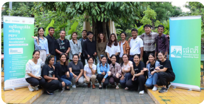
PEPY Accelerator Program participant orientation session

This quarter has been a transformative period for the YISI program. Notable achievements include the development of the PEPY Launchpad comprehensive Monitoring and Evaluation (M&E) Log Frame , in collaboration with This Life Cambodia, which will enhance our capacity to track program impact and ensure accountability. A productive visit from the CO-OPERAID team further strengthened our partnership, allowing for valuable discussions and insights that will guide our future initiatives. These changes culminated in the successful completion of the PEPY Accelerator 8-week training program designed to equip aspiring entrepreneurs with essential skills to launch and scale their businesses. Participants engaged in dynamic training sessions covering critical topics, from "Lean Canvas methodology" and operations management to investment readiness, complemented by hands-on mentorship.