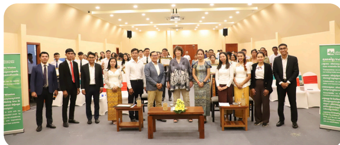
The Scholarship Recognition Ceremony celebrating university graduates at AMATAK by Landing Hotel

In late July, the scholarship team provided counseling to 28 students to address academic and personal challenges, while also conducting employer visits to assess student performance during internships. Additionally, 12 family visits were carried out to strengthen connections with students' families. Despite small challenges with the recent graduate unemployment rate (3%), this quarter brought notable achievements including the graduation of 13 students from Paññāsāstra University and several students securing full-time jobs .