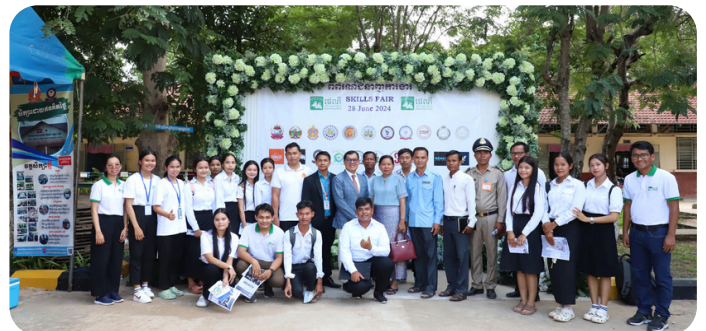
Local Education Official with PEPY staff, teachers, school principal, and students at the Skills Fair Event.

The Dream Management team achieved several key milestones this past quarter. We organized 16 Dream Talks featuring 55 speakers and reaching 751 students . The purpose of the Dream Talks was to inspire and empower grade 10-12 students to learn insights from individuals who have a similar background to the students and have achieved success. By sharing their journeys and the lessons learned, the invited speakers motivated our students to pursue their own dreams and aspirations. In late June, PEPY organized a Skills Fair hosted by Varin High School which attracted 32 companies and involved 672 students . The fair was centered around students exploring a wide variety of career paths and with representatives from all 32 institutions while learning about training programs, skill-building workshops, and networking for potential internships and scholarship opportunities. In addition to the Fair, PEPY also arranged