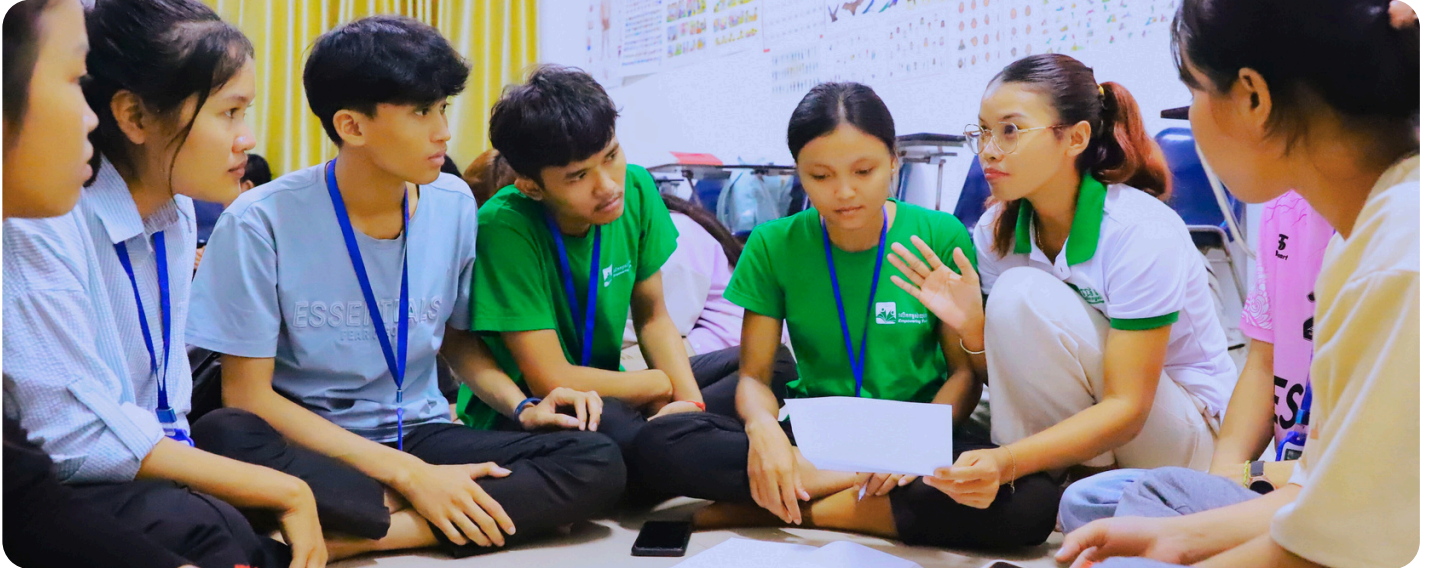
Students learning about communication skills in Youth Empowerment Class

In the past quarter, PEPY's programs and initiatives achieved significant milestones aimed at empowering students and enhancing their career readiness. We have celebrated the achievements of program and university graduates , while also hosting and facilitating activities such as student debates, workshops, group discussions, public speaking events and even competitions that encouraged practical skill application, confidence building, networking and community engagement.