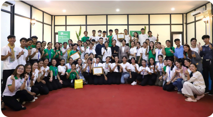
Above: PEPY Youth Debate Contest at The Elephant Hotel

We also celebrated the return of the Cambodia-Ireland Exchange Program with 3 weeks of team-building activities, such as Irish traditional dancing, educational games and discussions that enhanced the students' English proficiency, and lessons built cultural awareness. This is the 11th year of the exchange, and it is showing no sign of slowing down. Every visit from this group of dedicated educators leaves LC students and PEPY feeling grand.