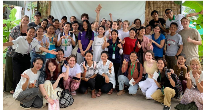
Photo of PEPY and TESIS students.

their English language comprehension by participating in regular group discussions, presentations, and sharing sessions. These improvements were reflected in their recent progress test, where students had an average score of 68%, which is a 35% increase from their pre-test!