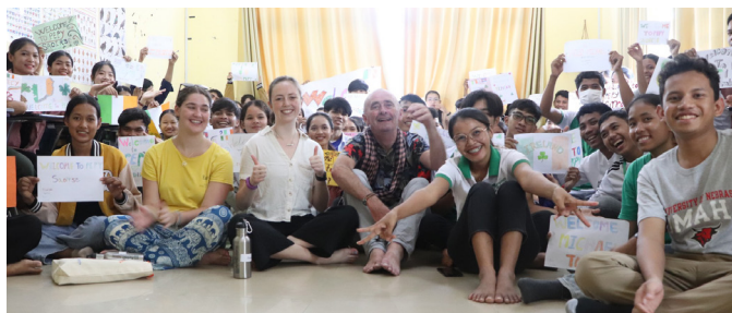
Photo of Irish teachers with PEPY students and staff.

Foundation, granted us 10 scholarships! Now more young people will have the resources to pursue their dreams AND uplift their communities. Prudential Cambodia Life Insurance provided the space and IT for our YISI Office and our new Community Computer Lab. Lastly, new partners, Rotary District 7170 and the Rotary Club of Dryden, New York gave us a $5,000 grant for our Dream Project in Varin High School.