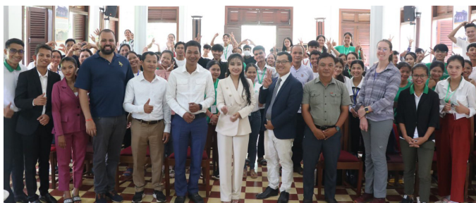
Photo from the Youth Panel Discussion event.