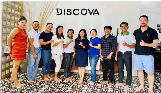
Photo of our team conducting a employer visit.