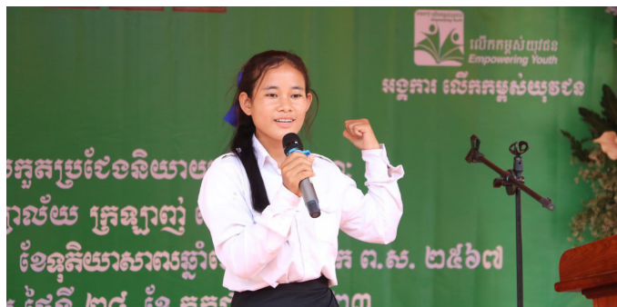
One of the finalists in the Public Speaking Competition.

This quarter, we ended our classes with over 800 Dream students. We also either met or surpassed our annual Dream class target at each school of 45 lessons per year. We also led several events including two study tours to Siem Reap City universities and vocational training centers for close to 300 Grade 12 students from all three schools. We held a combined Kralanh and Sen Sok High School Speaking Contest for 12 finalists from Kralanh and four finalists from Sen Sok who bravely faced an audience of over 400 attendees. Additionally, we had 41 Dream Talks this quarter (10 in Sen Sok, 21 in Kralanh, and 10 in Varin) featuring PEPY scholars and community members who shared topics with the students. Through our data tracking, we saw that while graduation rates are fairly consistent, the percentage of Dream students accessing higher education is close to 30% higher than non-Dream students. This has further motivated us to help our partner schools so ALL students will have the resources to continue their education and achieve their goals.