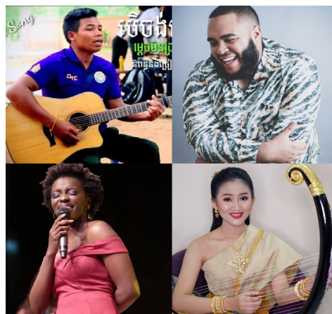
4 of the 17 Artists from our 'Our Story' International Benefit Concert

Lastly, we spent this quarter making improvements to our program and admin applications through our summer partnership with Nutanix!