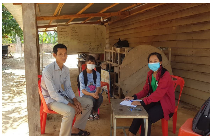
Figure 1: 2019 Scholars' employment status

The recruitment for the 2021 scholars is moving along quickly this quarter! Despite lockdowns and outbreaks preventing the scholarship recruitment process, the team was successfully able to complete the school interviews and the social investigations in 2 out of the 3 target districts in Siem Reap Province. The team will have to wait until COVID-19 restrictions are lifted to go to Srei Snam and complete their work before making final decisions on the new scholars.