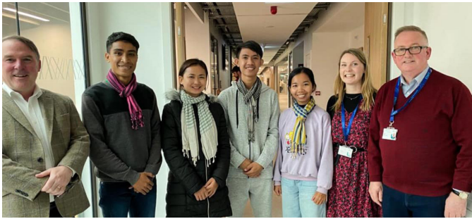
PEPY exchange group with the Technological University Dublin Department of Social Sciences