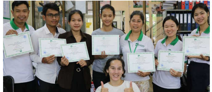
PEPY's first Tour Guide Certification Training